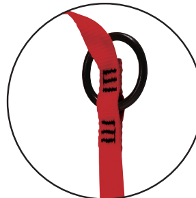
50mm 'O' Ring